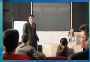
Chart your course.